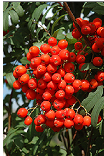
Pyramidal Mountain Ash fruit

Pyramidal Mountain Ash is recommended for the following landscape applications;