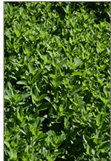
Spearmint foliage