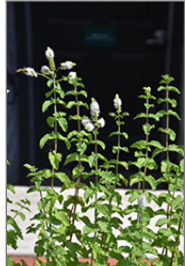
Spearmint flowers

Spearmint features bold spikes of lilac purple tubular flowers with white overtones rising above the foliage in late summer. Its attractive fragrant oval leaves remain green in colour throughout the season.