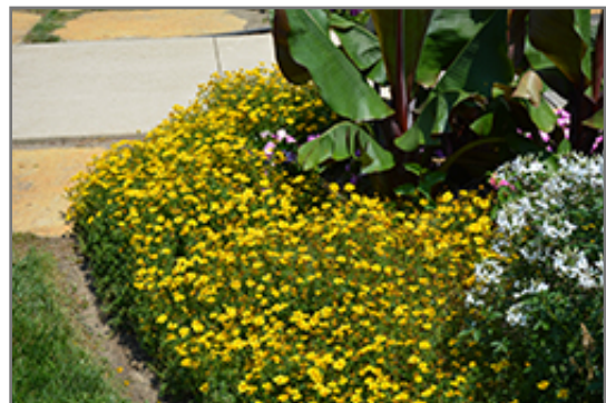
Goldilocks Rocks Bidens in bloom