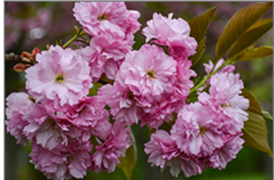
Kwanzan Flowering Cherry flowers

This plant is not reliably hardy in our region, and certain restrictions may apply; contact the store for more information.