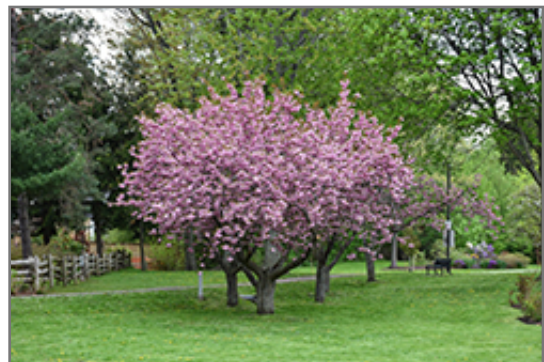
Kwanzan Flowering Cherry in bloom