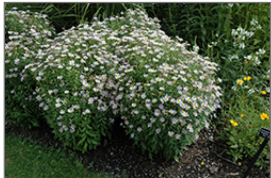
Blue Star Japanese Aster in bloom