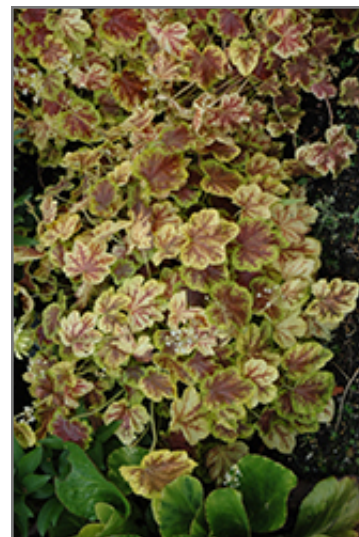
Solar Eclipse Foamy Bells