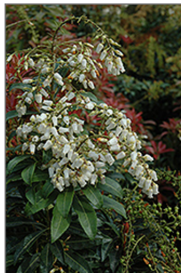
Mountain Fire Japanese Pieris flowers