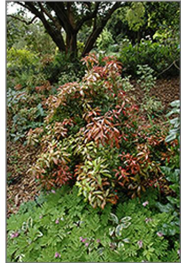
Mountain Fire Japanese Pieris

This plant is not reliably hardy in our region, and certain restrictions may apply; contact the store for more information.