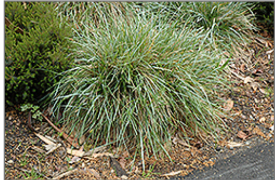
Blue Moor Grass