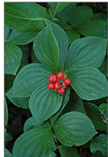
Bunchberry fruit