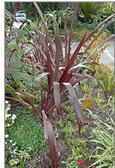
Amazing Red New Zealand Flax foliage