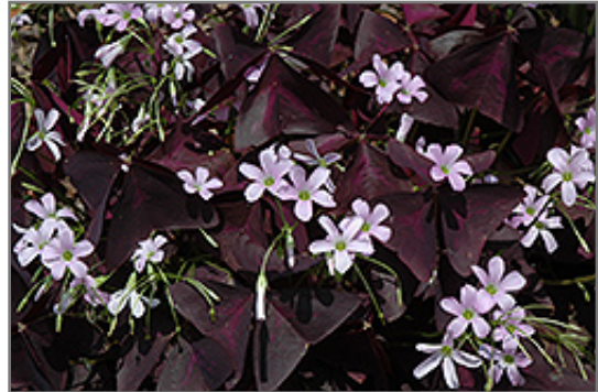
Purple Shamrock flowers