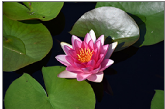
Attraction Hardy Water Lily flowers

Attraction Hardy Water Lily is ideally suited for growing in a pond, water garden or patio water container, and is recommended for the following landscape applications;