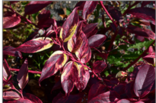
Rainbow Fetterbush in fall

* This is a 'special order' plant - contact store for details