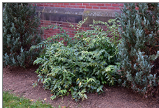
Rainbow Fetterbush