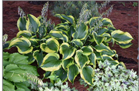
Atlantis Hosta

Atlantis Hosta is recommended for the following landscape applications;