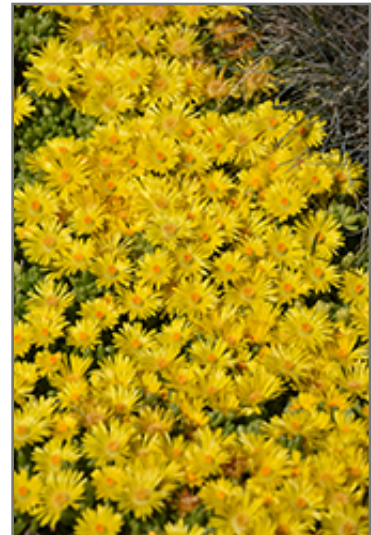
Yellow Ice Plant flowers

Yellow Ice Plant is recommended for the following landscape applications;