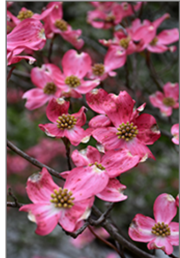
Cherokee Chief Flowering Dogwood flowers

This is a relatively low maintenance tree, and usually looks its best without pruning, although it will tolerate pruning. It is a good choice for attracting birds to your yard. Gardeners should be aware of the following characteristic(s) that may warrant special consideration;