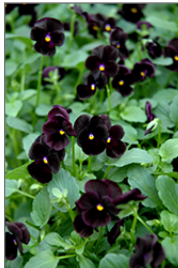
Sorbet Black Delight Pansy flowers

This plant will require occasional maintenance and upkeep, and should only be pruned after flowering to avoid removing any of the current season's flowers. Deer don't particularly care for this plant and will usually leave it alone in favor of tastier treats. Gardeners should be aware of the following characteristic(s) that may warrant special consideration;