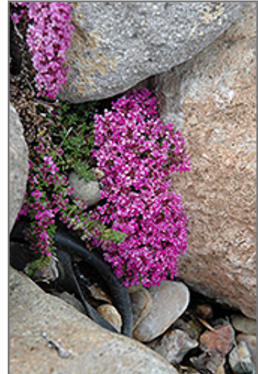
Pink Chintz Creeping Thyme in bloom

This plant should only be grown in full sunlight. It prefers to grow in average to dry locations, and dislikes excessive moisture. It is considered to be drought-tolerant, and thus makes an ideal choice for a low-water garden or xeriscape application. It is not particular as to soil type or pH. It is highly tolerant of urban pollution and will even thrive in inner city environments. Consider covering it with a thick layer of mulch in winter to protect it in exposed locations or colder microclimates. This is a selected variety of a species not originally from North America. It can be propagated by division; however, as a cultivated variety, be aware that it may be subject to certain restrictions or prohibitions on propagation.