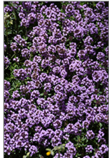
Pink Chintz Creeping Thyme flowers