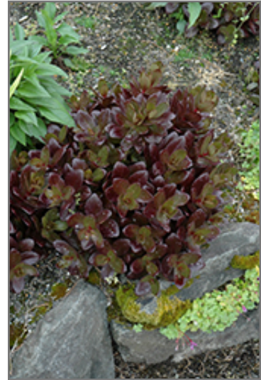
Chocolate Drop Stonecrop

Chocolate Drop Stonecrop is a dense herbaceous perennial with an upright spreading habit of growth. Its relatively coarse texture can be used to stand it apart from other garden plants with finer foliage.