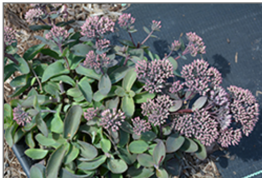
Chocolate Drop Stonecrop flower buds