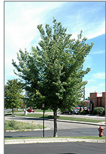
Common Hackberry