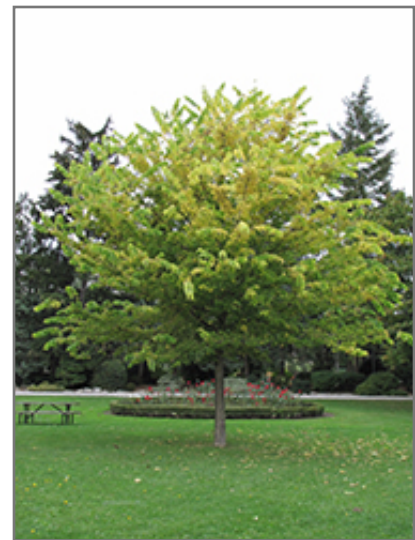
Common Hackberry in fall