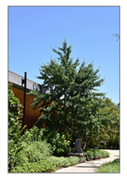
Autumn Gold Ginkgo