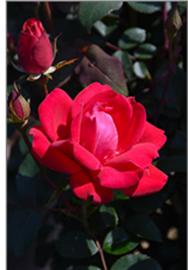
Double Knock Out Rose flowers