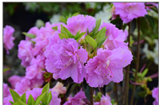
Elsie Lee Azalea flowers