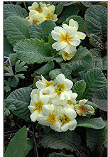
Wanda Primrose flowers

Wanda Primrose is recommended for the following landscape applications;