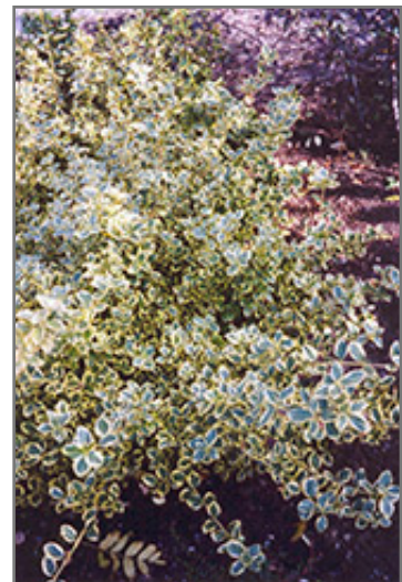
Canadale Gold Wintercreeper