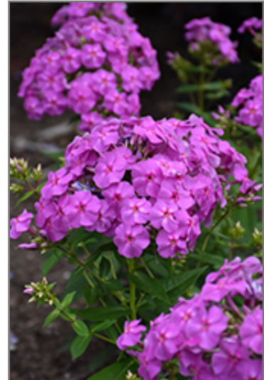
Flame Lilac Garden Phlox flowers

Flame Lilac Garden Phlox is recommended for the following landscape applications;