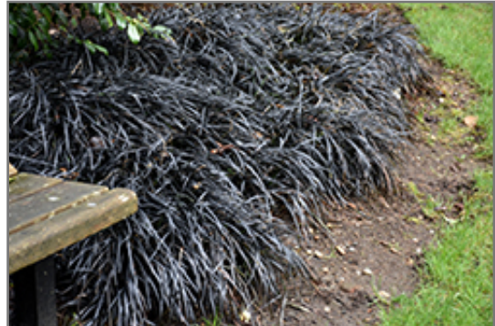
Black Mondo Grass

Black Mondo Grass is recommended for the following landscape applications;