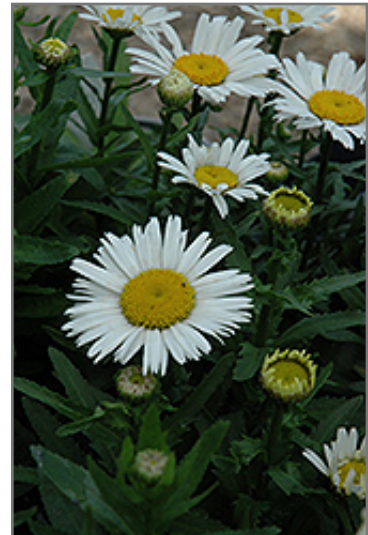
Snow Lady Shasta Daisy flowers

Snow Lady Shasta Daisy is recommended for the following landscape applications;