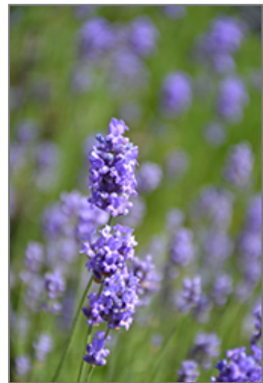
Hidcote Blue Lavender flowers