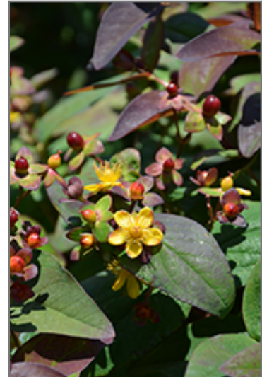
Albury Purple St. John's Wort flowers

Albury Purple St. John's Wort is recommended for the following landscape applications;