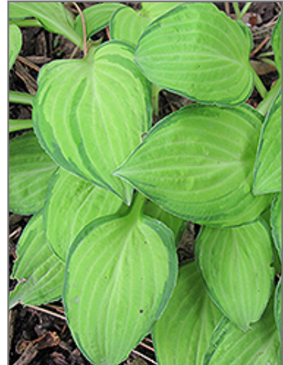
Emerald Tiara Hosta foliage