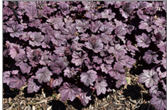
Sugar Plum Coral Bells

Sugar Plum Coral Bells will grow to be about 12 inches tall at maturity extending to 24 inches tall with the flowers, with a spread of 18 inches. When grown in masses or used as a bedding plant, individual plants should be spaced approximately 15 inches apart. Its foliage tends to remain dense right to the ground, not requiring facer plants in front. It grows at a medium rate, and under ideal conditions can be expected to live for approximately 10 years. As an evergreen perennial, this plant will typically keep its form and foliage year-round.