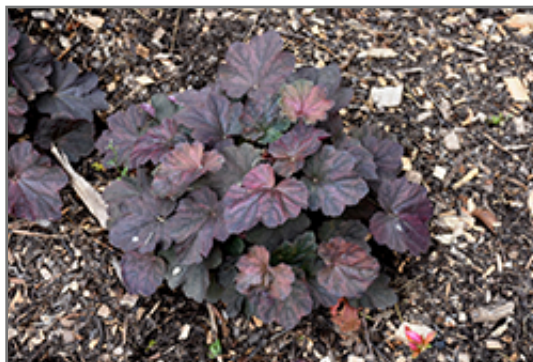
Mocha Coral Bells