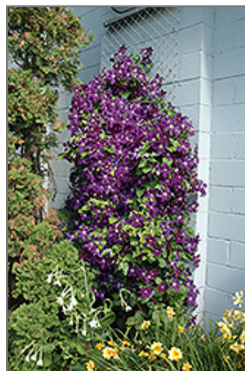
Jackmanii Superba Clematis in bloom