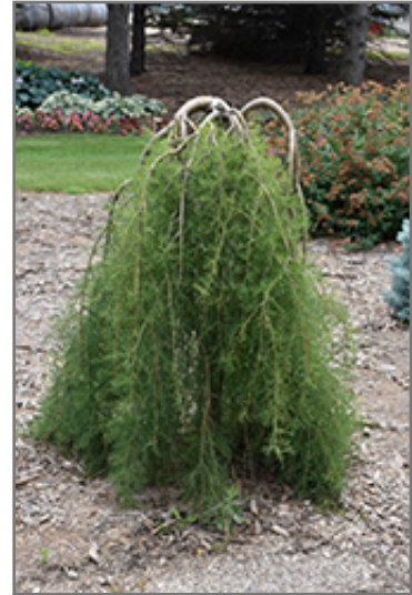
Walker Weeping Peashrub

This shrub does best in full sun to partial shade. It prefers dry to average moisture levels with very well-drained soil, and will often die in standing water. It is considered to be drought-tolerant, and thus makes an ideal choice for xeriscaping or the moisture-conserving landscape. It is not particular as to soil type or pH, and is able to handle environmental salt. It is highly tolerant of urban pollution and will even thrive in inner city environments. This is a selected variety of a species not originally from North America.