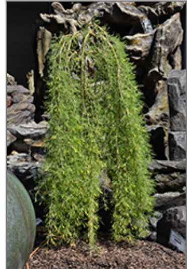
Walker Weeping Peashrub