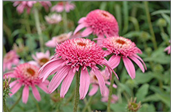
Cone-fections Pink Double Delight Coneflower flowers

This is a relatively low maintenance plant, and is best cleaned up in early spring before it resumes active growth for the season. It is a good choice for attracting butterflies to your yard, but is not particularly attractive to deer who tend to leave it alone in favor of tastier treats. It has no significant negative characteristics.