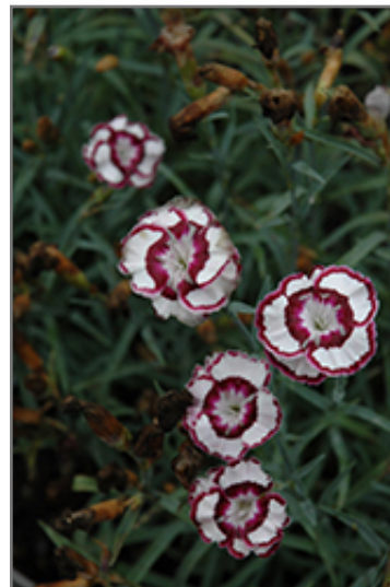
Raspberry Swirl Pinks flowers

This is a relatively low maintenance plant, and is best cleaned up in early spring before it resumes active growth for the season. It is a good choice for attracting bees and butterflies to your yard, but is not particularly attractive to deer who tend to leave it alone in favor of tastier treats. It has no significant negative characteristics.