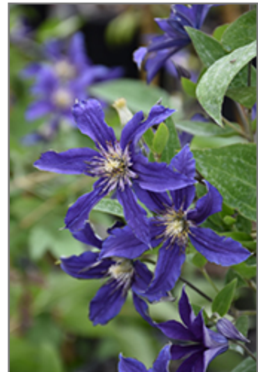
Sapphire Indigo Clematis flowers