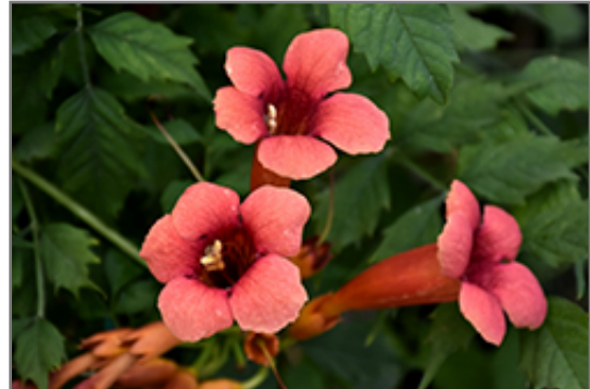
Flamenco Trumpetvine flowers

This is a high maintenance woody vine that will require regular care and upkeep, and can be pruned at anytime. It is a good choice for attracting birds and hummingbirds to your yard, but is not particularly attractive to deer who tend to leave it alone in favor of tastier treats. Gardeners should be aware of the following characteristic(s) that may warrant special consideration;