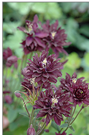
Clementine Dark Purple Columbine flowers