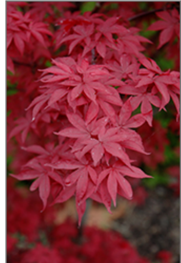
Twombly's Red Sentinel Japanese Maple foliage

Twombly's Red Sentinel Japanese Maple is recommended for the following landscape applications;