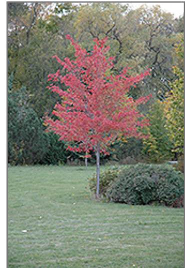
Northfire Red Maple in fall

* This is a 'special order' plant - contact store for details