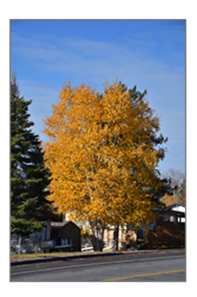
Clump Paper Birch in fall