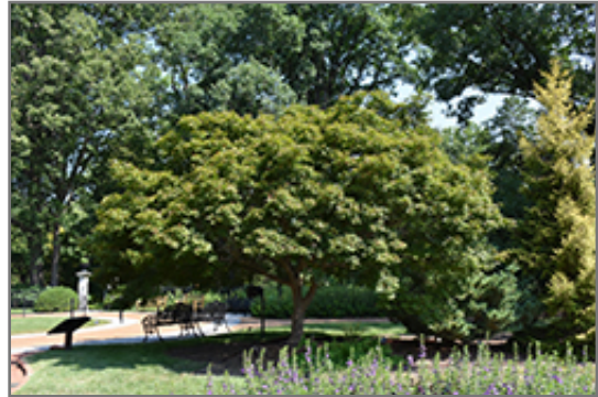
Trompenburg Japanese Maple

Trompenburg Japanese Maple will grow to be about 25 feet tall at maturity, with a spread of 20 feet. It has a low canopy with a typical clearance of 4 feet from the ground, and is suitable for planting under power lines. It grows at a slow rate, and under ideal conditions can be expected to live for 80 years or more.