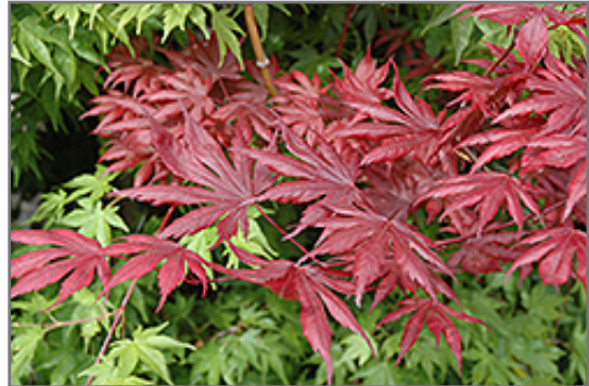
Trompenburg Japanese Maple foliage

This is a relatively low maintenance tree, and should only be pruned in summer after the leaves have fully developed, as it may 'bleed' sap if pruned in late winter or early spring. It has no significant negative characteristics.