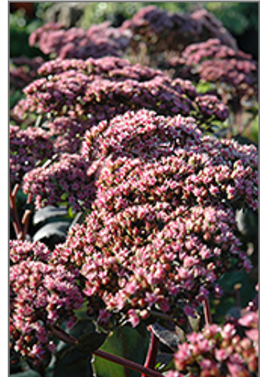
Maestro Stonecrop flowers

This is a relatively low maintenance plant, and is best cleaned up in early spring before it resumes active growth for the season. It is a good choice for attracting bees and butterflies to your yard, but is not particularly attractive to deer who tend to leave it alone in favor of tastier treats. It has no significant negative characteristics.