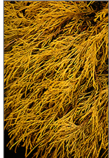
Lemon Thread Falsecypress foliage

Lemon Thread Falsecypress makes a fine choice for the outdoor landscape, but it is also well-suited for use in outdoor pots and containers. Because of its height, it is often used as a 'thriller' in the 'spiller-thriller-filler' container combination; plant it near the center of the pot, surrounded by smaller plants and those that spill over the edges. It is even sizeable enough that it can be grown alone in a suitable container. Note that when grown in a container, it may not perform exactly as indicated on the tag - this is to be expected. Also note that when growing plants in outdoor containers and baskets, they may require more frequent waterings than they would in the yard or garden.