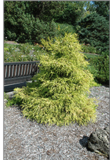
Lemon Thread Falsecypress

Lemon Thread Falsecypress is recommended for the following landscape applications;