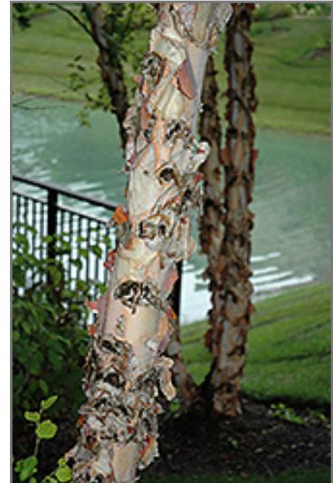
River Birch bark