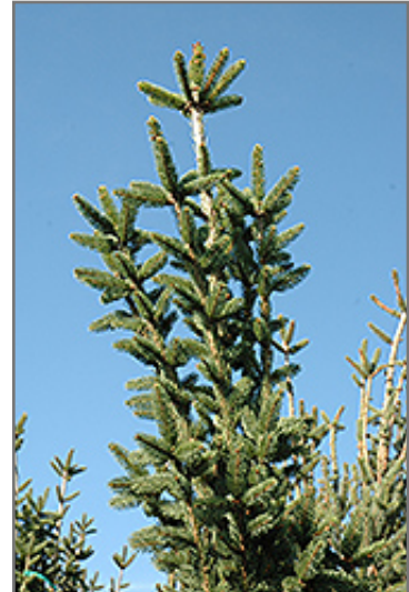
Columnar Norway Spruce foliage