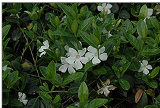
White Periwinkle flowers