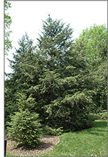
Canadian Hemlock

Canadian Hemlock is recommended for the following landscape applications;